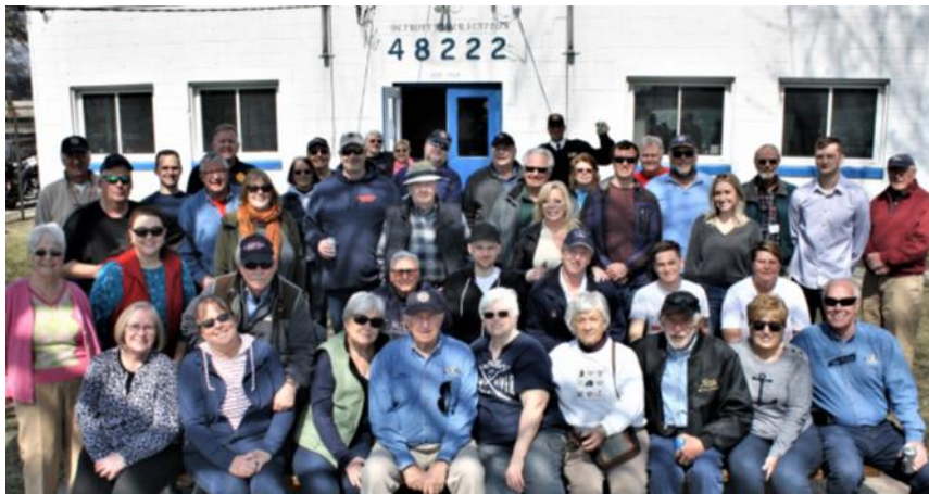
Lodge #7 annual barbeque group photo.